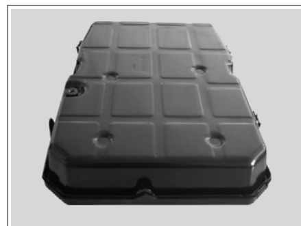
Figure 1: Old oil pan (with rounded contours) Transmission 722.9 up to transmission component serial number 2834526